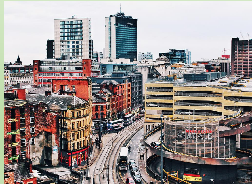
Manchester, 21 st century

Places : Manchester; Memphis; Phoenix (Arizona)