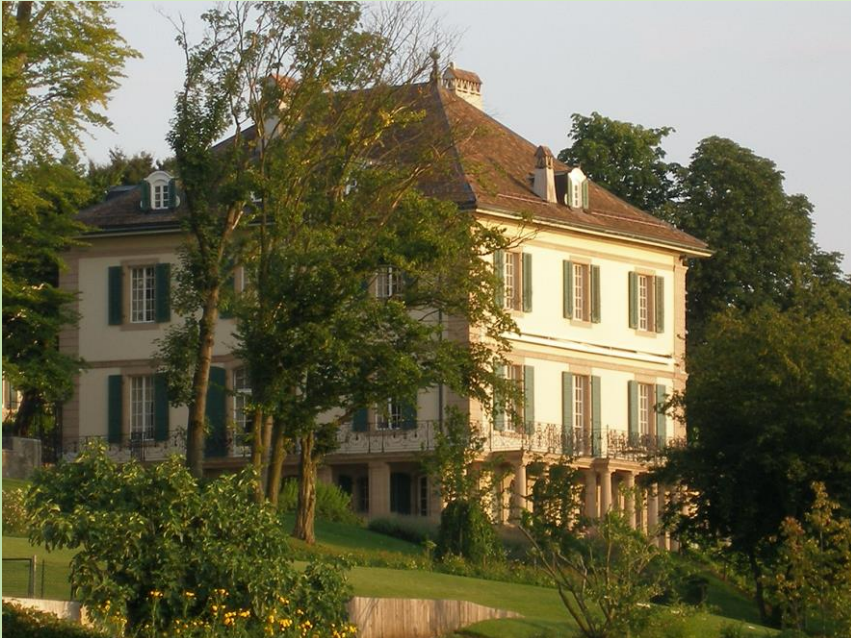
Villa Diodati, Ginevra