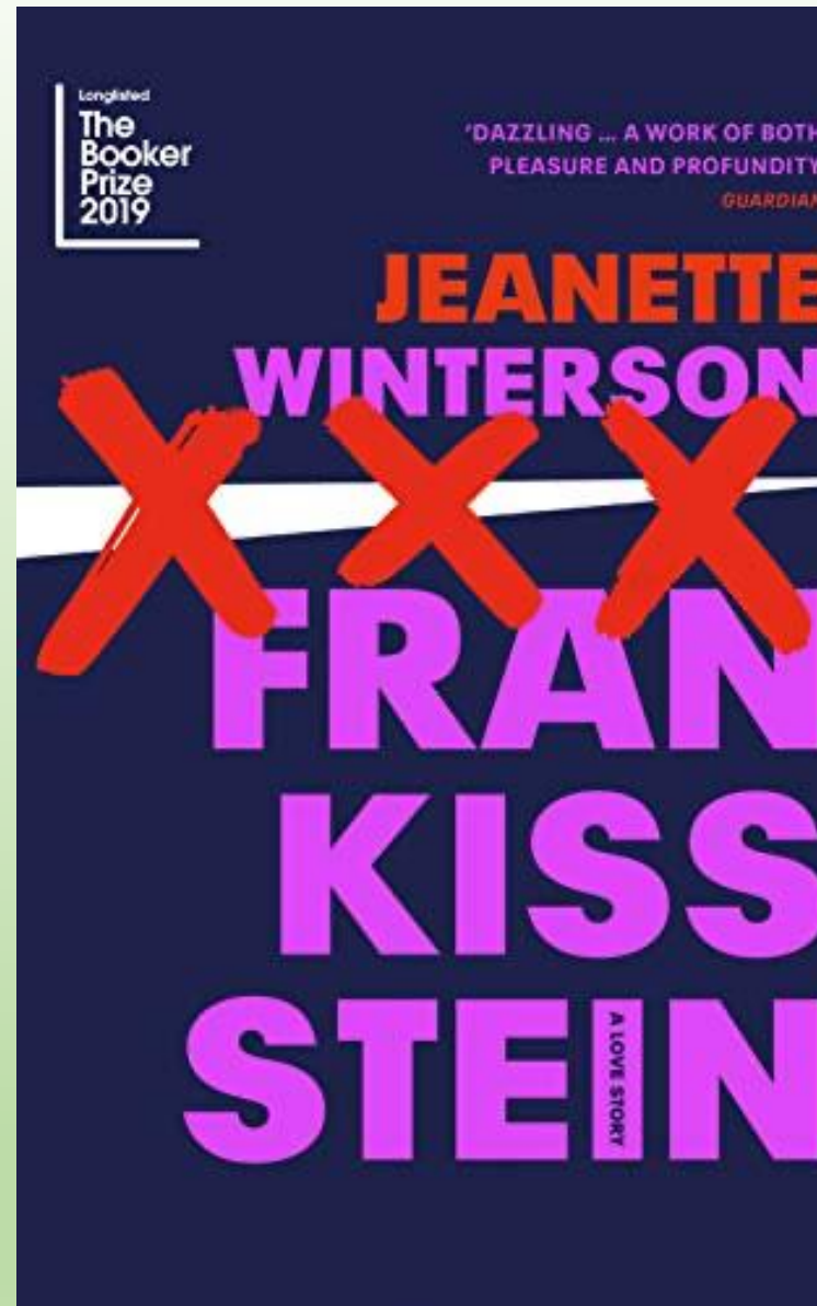
Front cover of the book