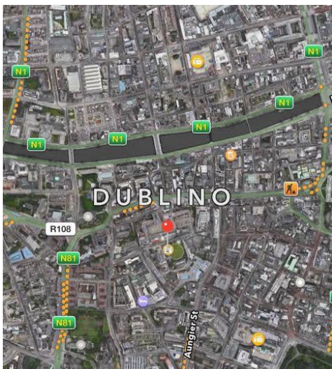
The Chester Beatty Library

At 17.00 the guide led us to the Spire where we took the bus and return home.