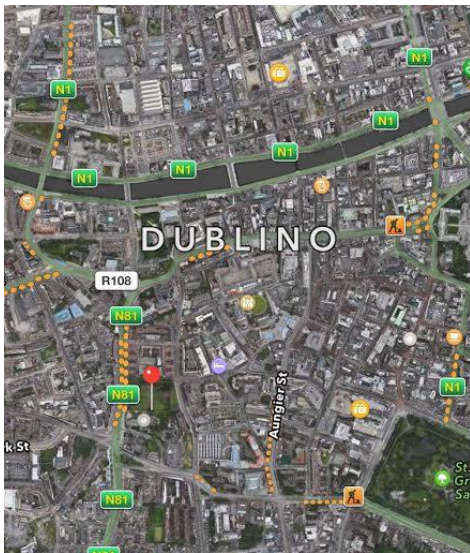
St Patrick Cathedral